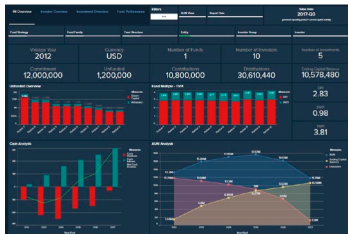
Investment manager overview: the dashboard landing page illustrates key manager KPIs and provides drill-down to the fund and investor allocations

Our combination of proprietary and best-in-breed vendor solutions make reporting and data access flexible and fully transparent.