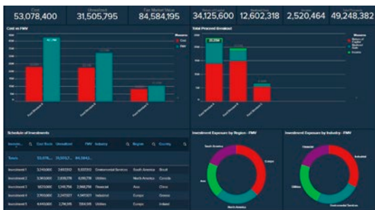
Investment overview: comprehensive view of SOI and investment realizations by GL component, plus investment exposure by region/country and industry