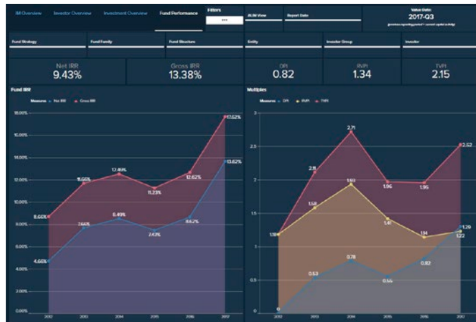
Fund performance view: IRR and multiple calculations at the fund level with investor pierce-through, plus historical trend analysis from fund inception