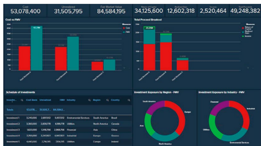
Investment overview: comprehensive view of SOI and investment realizations by GL component, plus investment exposure by region/country and industry