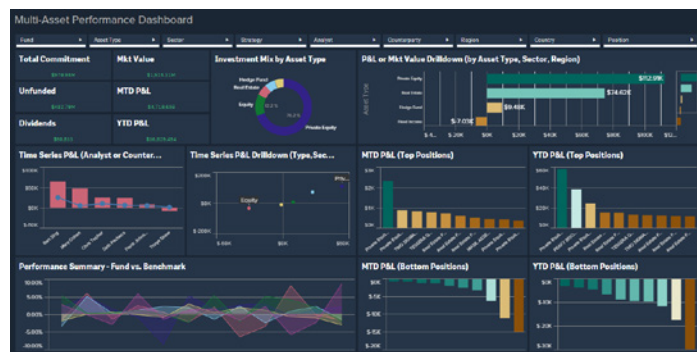
CitcoOne multi-asset performance dashboard

We provide a greater range of services than other family office service providers. Our asset servicing covers the entire fund trading, clearing and settlement lifecycle, and we provide a complete suite of risk, reporting, tax, treasury and depositary services.